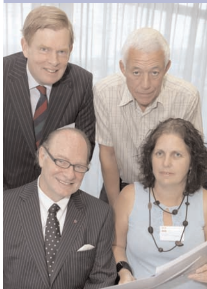
A number of Shropshire Business Ambassadors will be involved in the mentoring scheme

Initially 10 businesses are being sought to take advantage of the mentoring scheme. Individuals who are planning to set up in business or those who wish to expand their business and would appreciate some guidance on how to move their plans to the next level can apply via the Council's Economic Development Team by e-mailing businessvision@shropshire.gov.uk